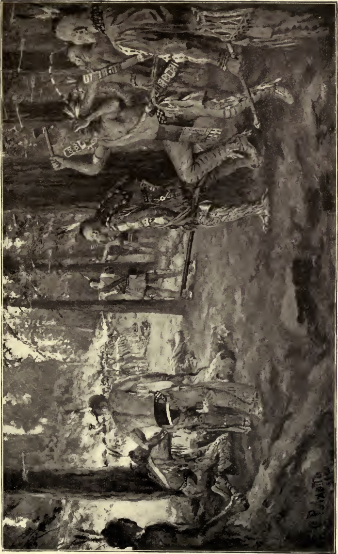
"The men had been hastily formed into a square."